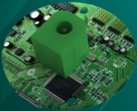
Schaff HDV2 TMS

Shatter Free Front Glass For Ultra Clarity and Minimal Light Loss