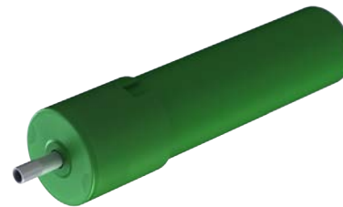
4000 mAh Battery

Schaff Propreitory Design Battery Interface ensures Consistent and trouble free Performance in demanding and varied climatic conditions